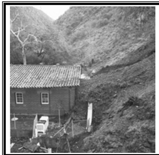
Silverado Canyon in Orange county California, February 1969

Orange County has a History of Mudslides: On February 25, 1969, following a series of rainstorms, a devastating mudslide struck the fire station in Silverado Canyon. Flooding caused widespread damage, and the Silverado mudslide caused at least five fatalities.